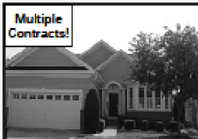
Sewells Pointe Dr