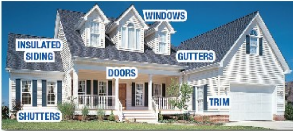
The Window World Franchise is independently owned & operated by Window World of Fredericksburg, Inc. under License from Window World Inc.